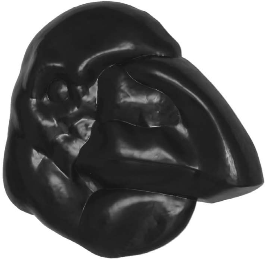
KILL THE GREAT RAVEN 2004 polystyrene 45 x 52 x 7cm