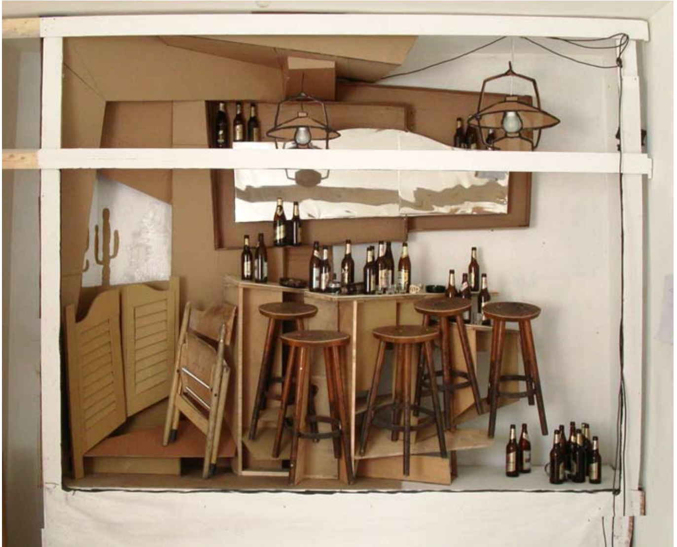
saloon 2004 wood, cardboard, mixed media ca. 400 x 300 x 50cm