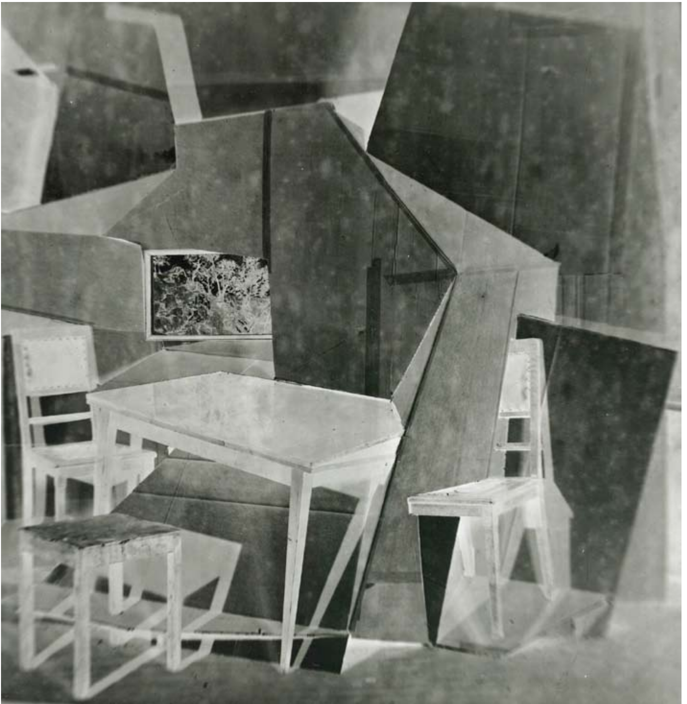
Kulissenphoto Series (2), 2001/2006 b/w photography with pinhole camera ca. 95 x 95cm Edition of 3/ 1+ AP