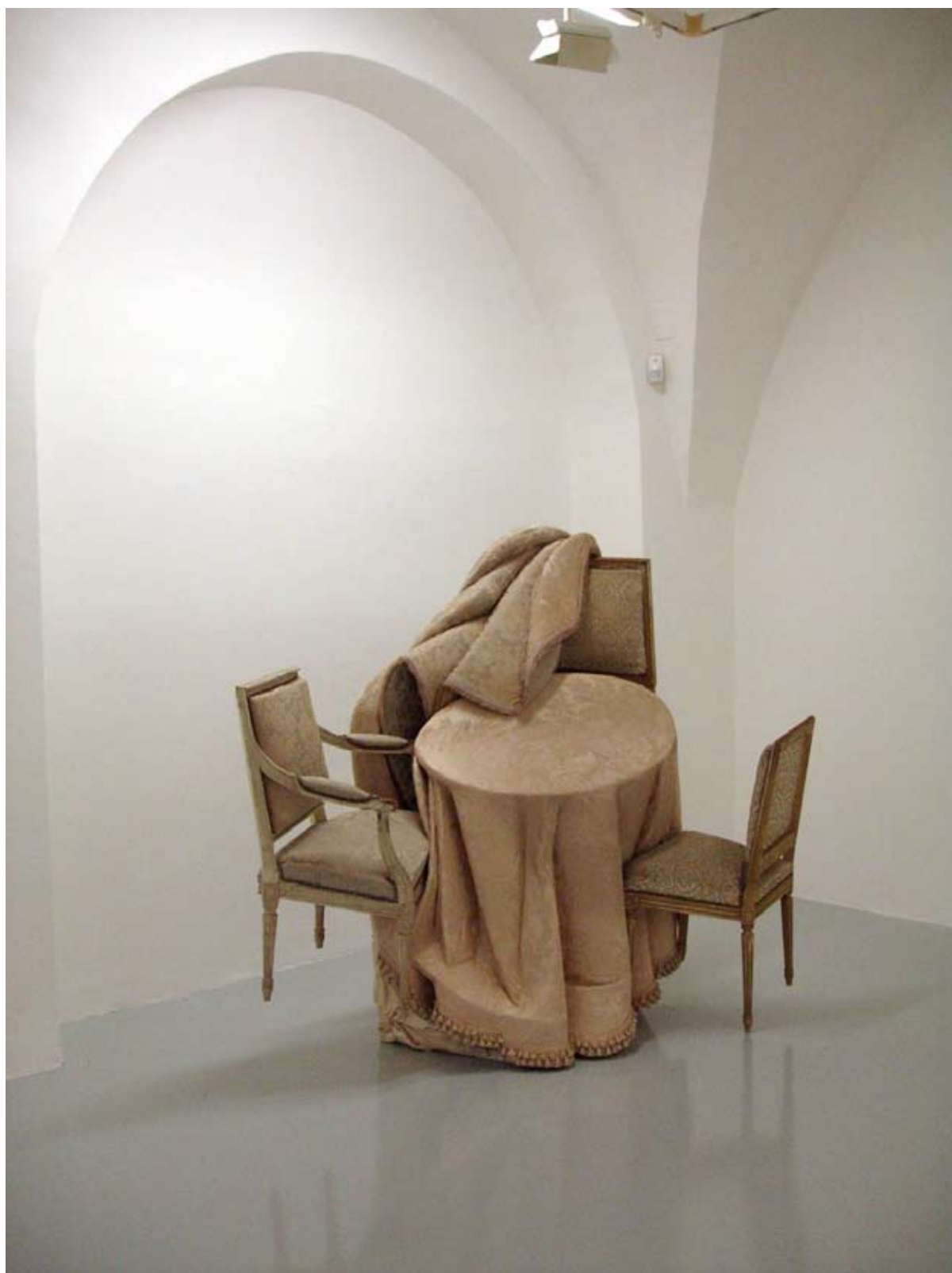
Séance, 2007 furniture, wood, card board, table cloth, curtain 190 x 78 x 165 cm