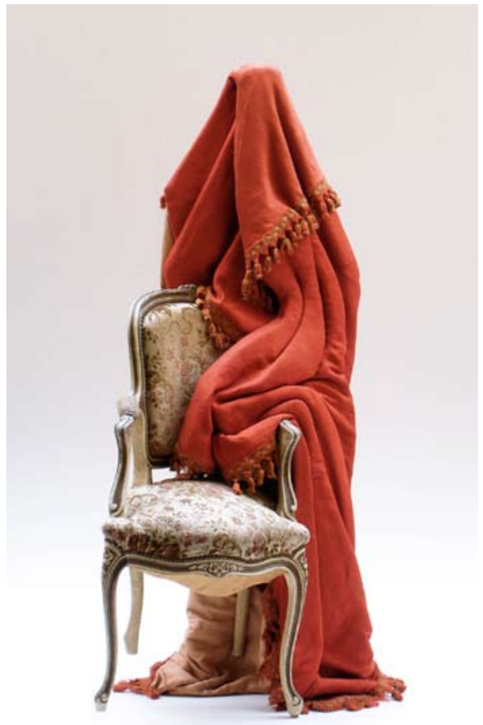
Fauteuil No. 2 2007 Chair, curtain 95 x 45 x 155cm