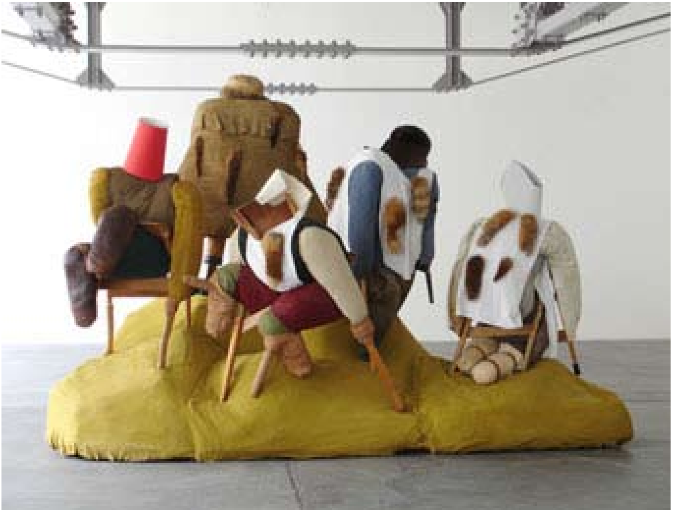
Beggars 2006 wood, fur, leather, mixed media ca. 300 x 150 x 200cm