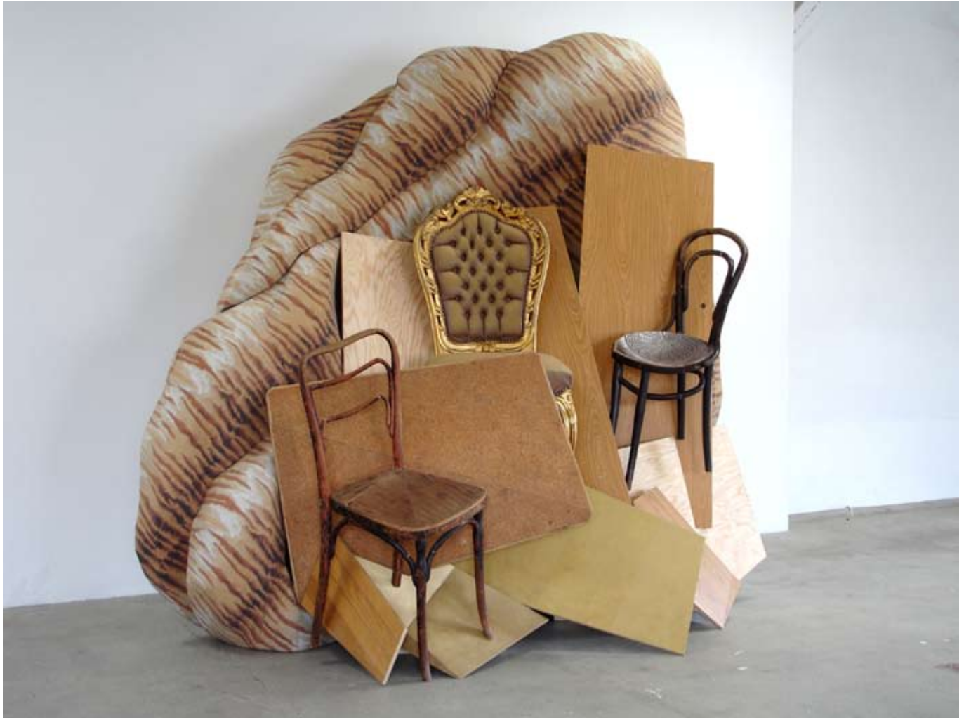
“mobili nella stanza“ (chairs in a room), 2008 aprox. 220 x 240 x 120 cm chairs, wood, cloth, glue paint