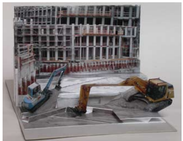
Treptow 2003 pop- up, inkjet on paper, cardboard 21 x 28 x 21cm