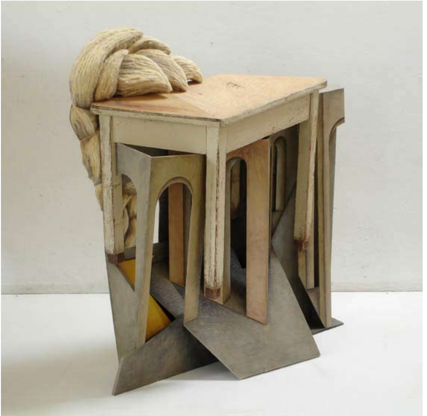
“il viaggio inquietante”, 2008 (side) 123 x 43 x 125 cm wood, cloth, acrylic on wood