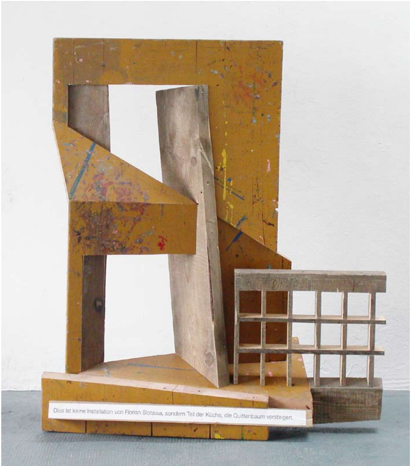
Frankfurt Kitchen 2005 Wood 110 x 125 x 45cm