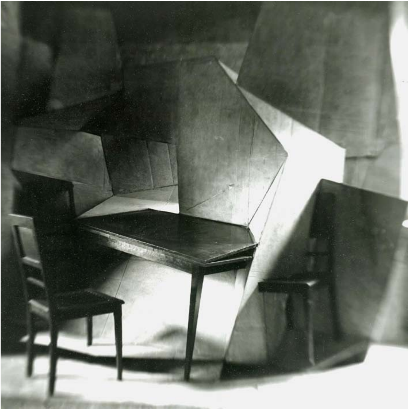
Kulissenphoto Series (1), 2001/2006 b/w photography with pinhole camera ca. 95 x 95cm Edition of 3/ 1+ AP