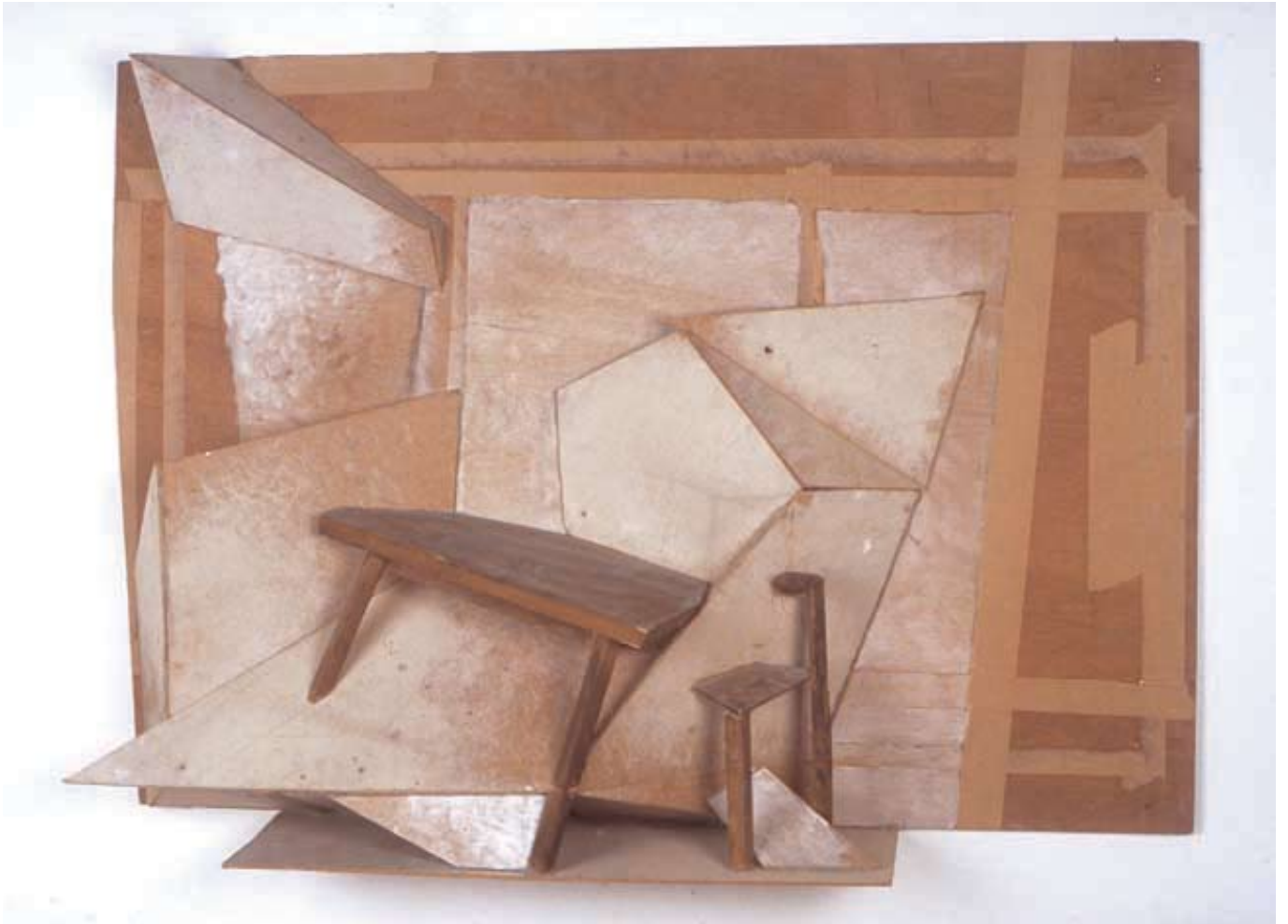
Stuhlrelief 2001/ 2006 wood, cardboard 70 x 100 x 18 cm