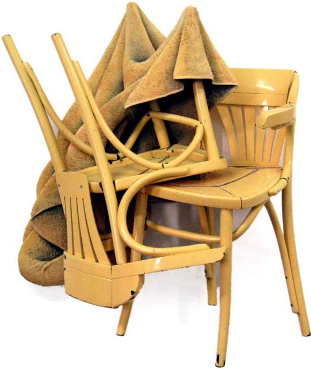
golden chair2, 2007 wood, towelling, gouache 130 x 90 x 35 cm