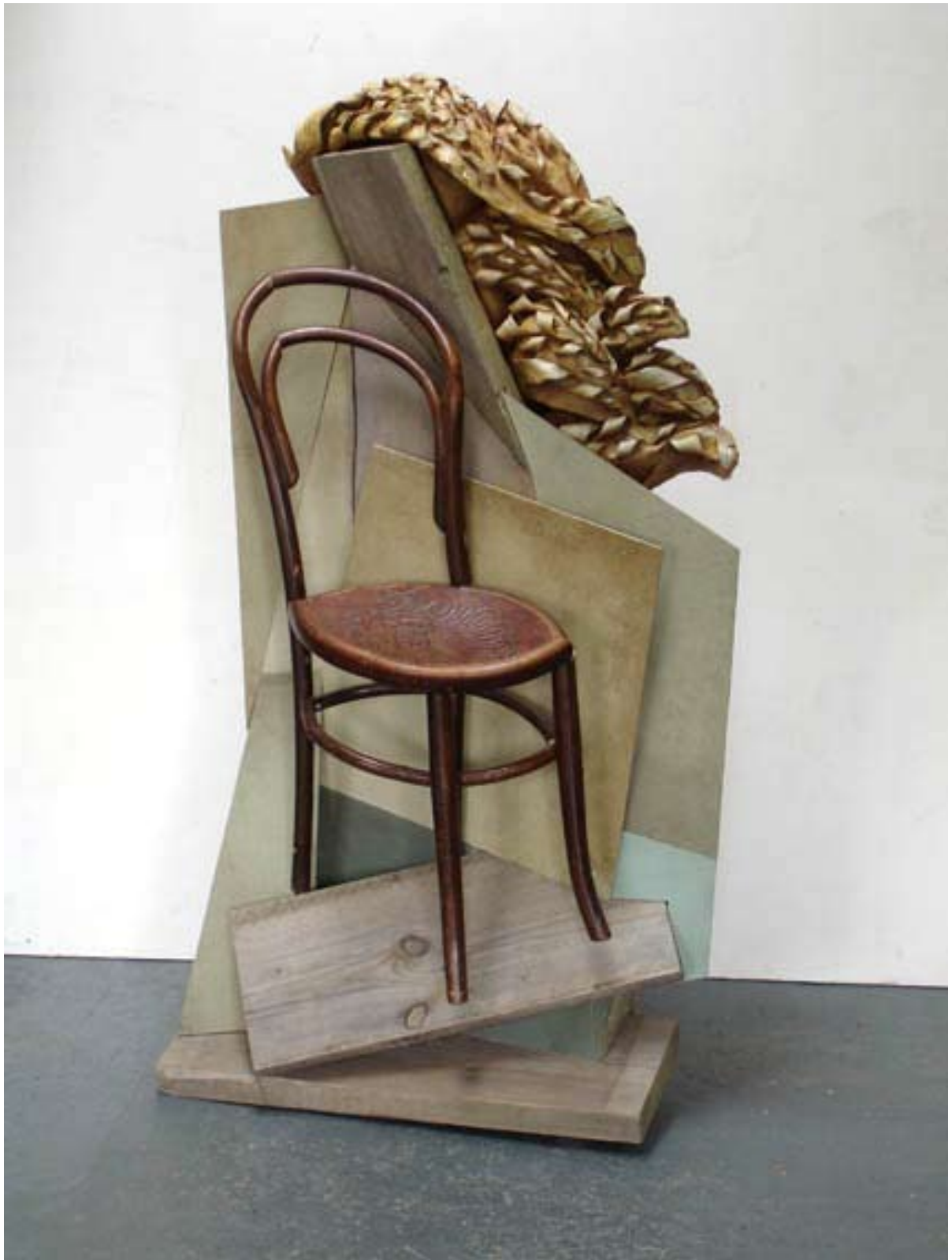
„cheval devant la mer 2“, (horse at the sea) 2008 aprox. 140 x 80 x 40cm chair, mdf, wood, glue paint