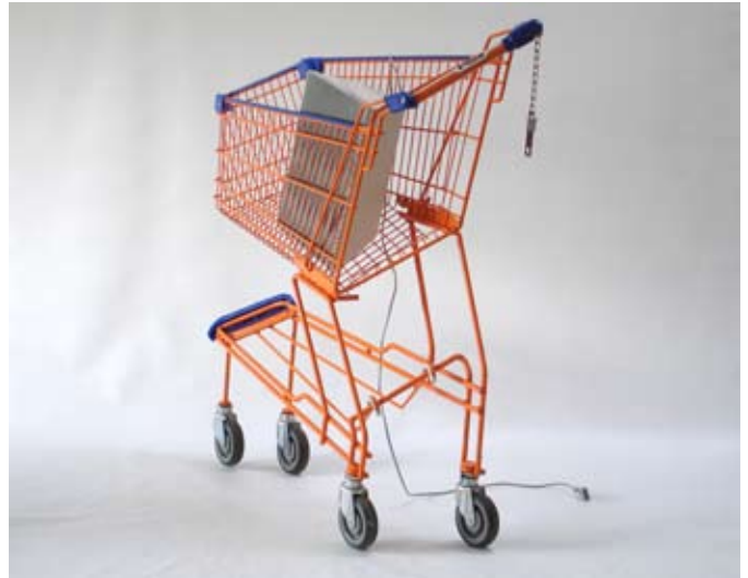
OPTICART 2006 Distorted shopping cart, Moiré effect lamp 125 x 118 x 32 cm