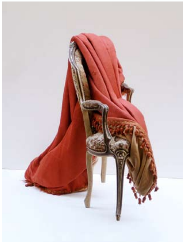
Fauteuil No. 1 2007 Chair, curtain 95 x 45 x 155cm