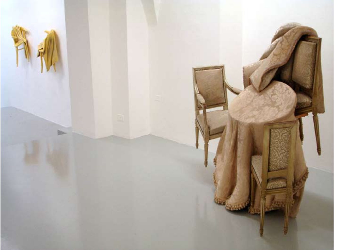
Séance, 2007 installation view Furini Arte Contemporanea, Arezzo, Italy, 2007