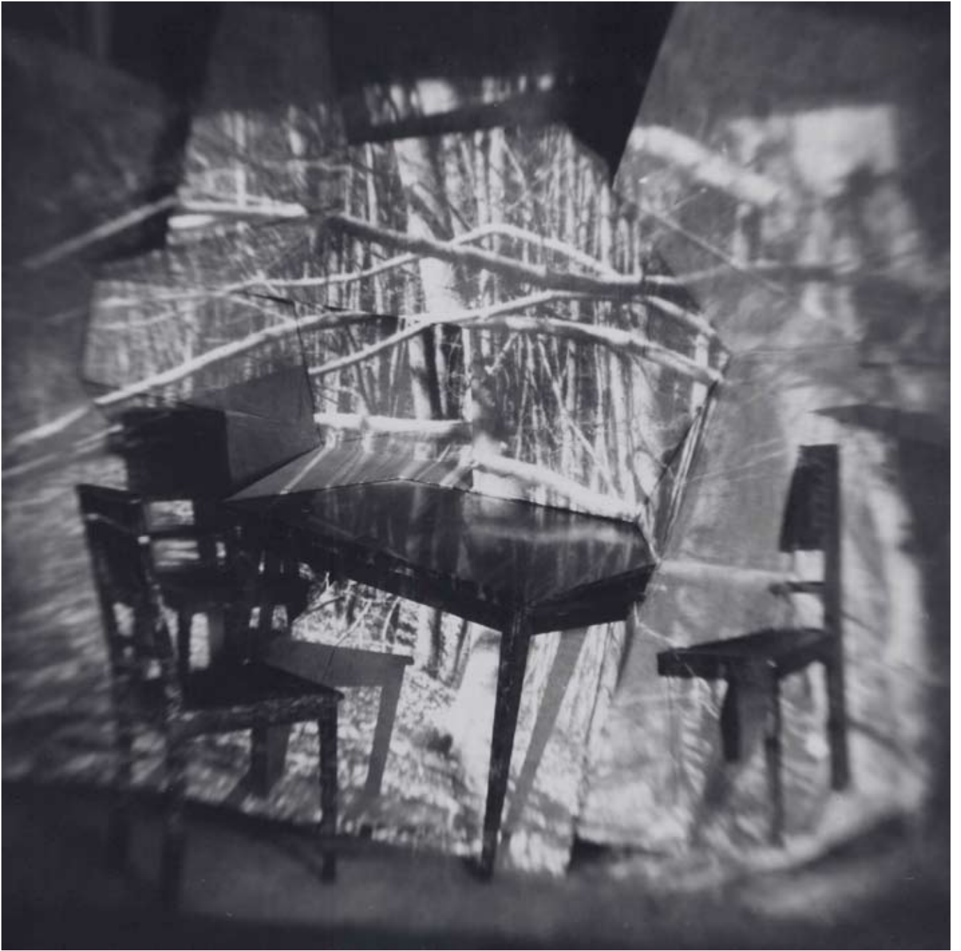
Baum 2001/2006 b/w photography with pinhole camera ca. 95 x 95cm Edition of 3/ 1+ AP