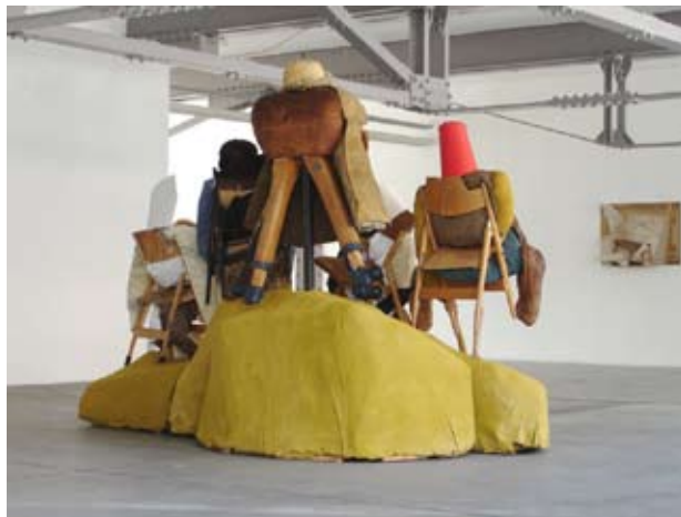
Beggars 2006 installationviews Kunsthalle Vebikus, Schaffhausen, CH