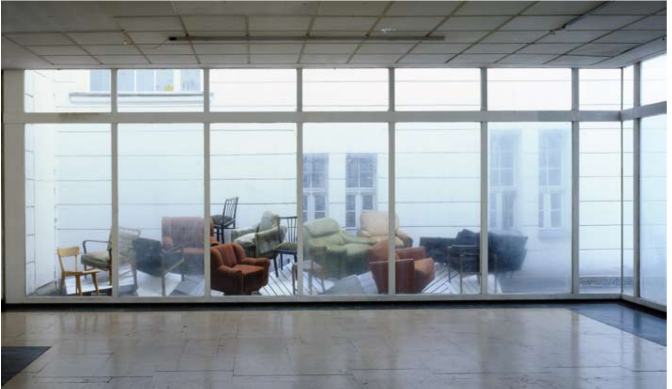
upholstery 2004 furniture, wood ca. 650 x 150 x 170cm frontal view at University of Arts, Berlin