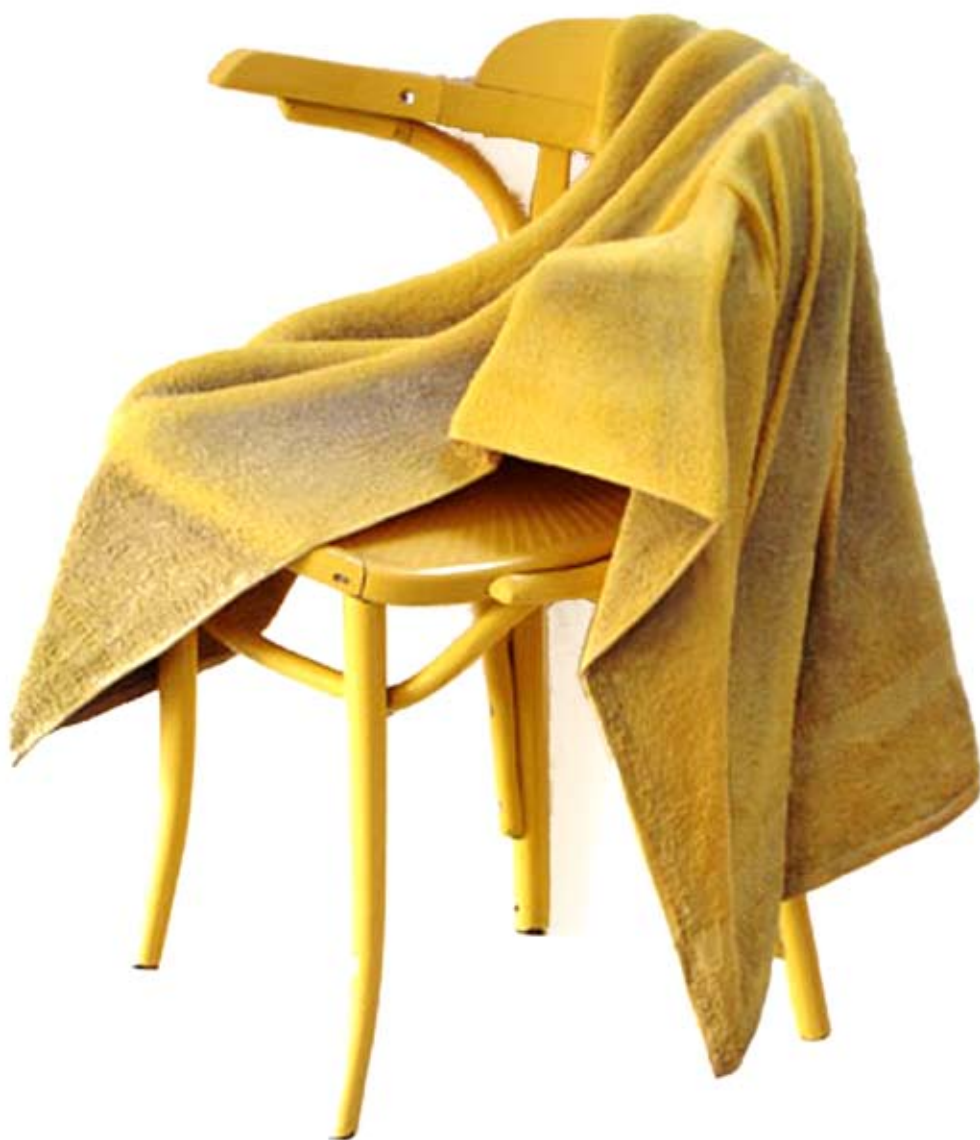
golden chair2, 2007 wood, towelling, gouache 110 x 80 x 30 cm