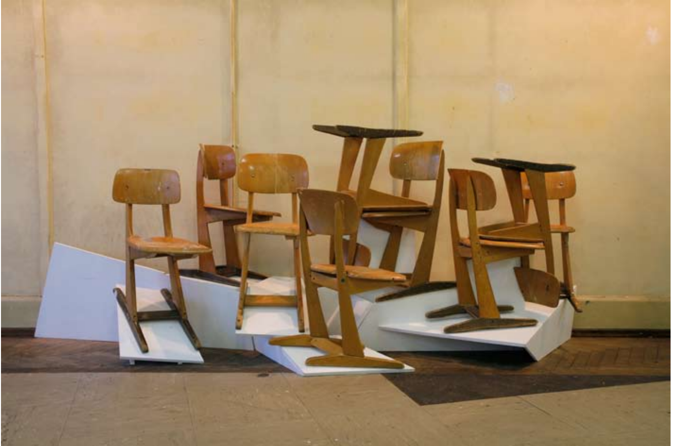
Kindergarten 2003/ 2006 chairs, wood 300 x 50 x 120cm installation view at Freymond-Guth, Fine Arts, Zürich