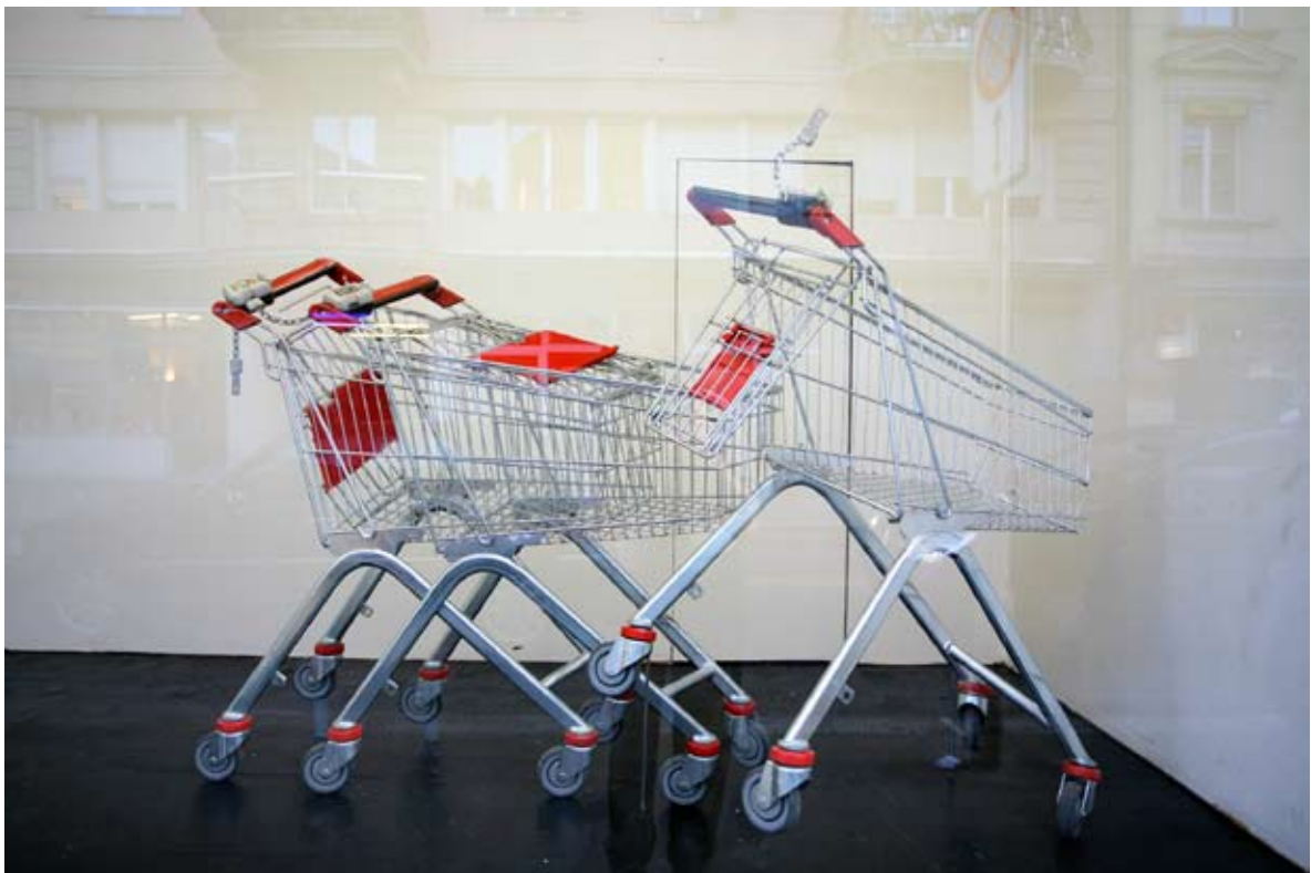
OPTICART II-IV 2006 distorted shopping carts 100 x 200 x 45cm