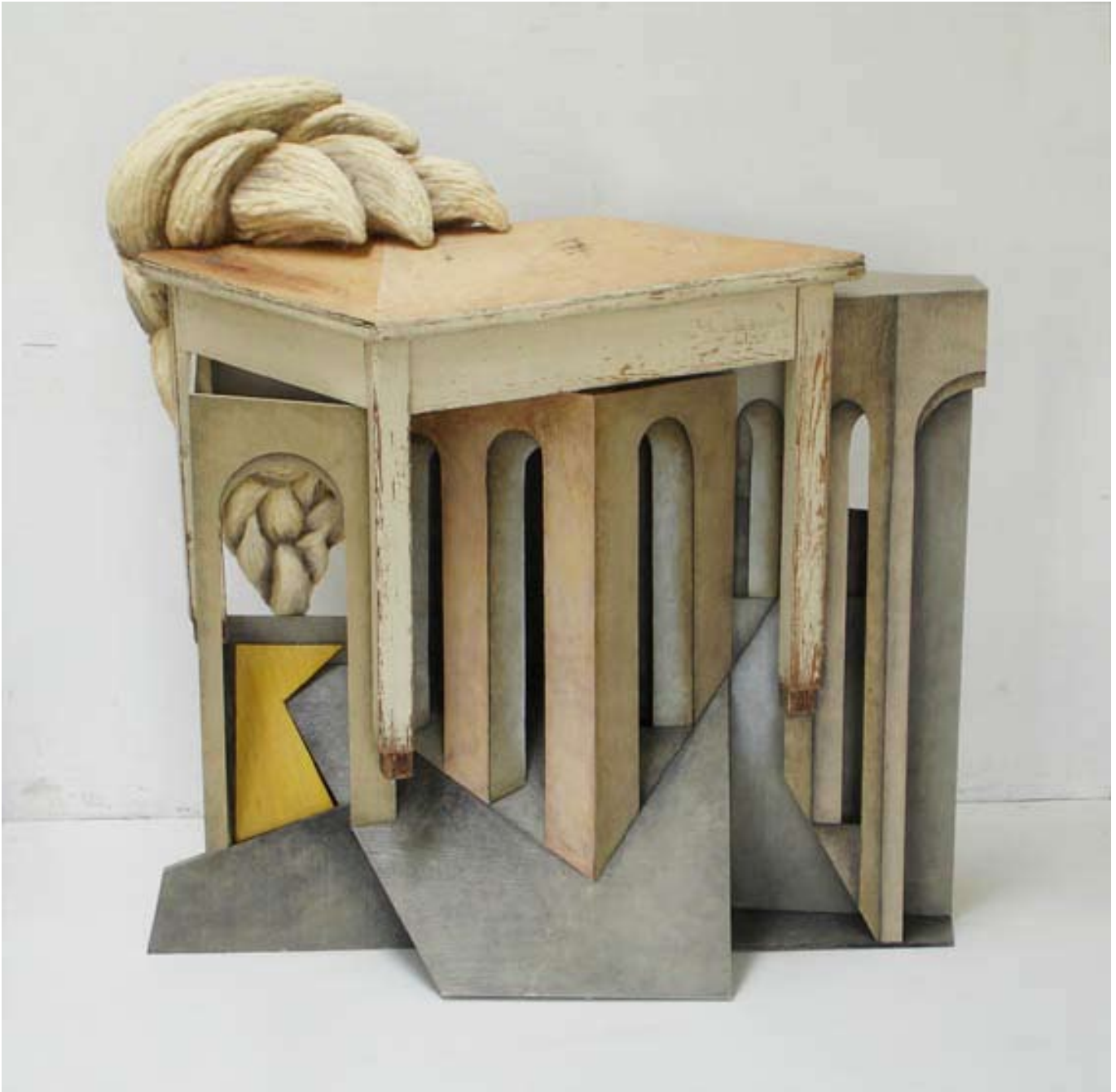
“il viaggio inquietante”, 2008 (front) 123 x 43 x 125 cm wood, cloth, acrylic on wood