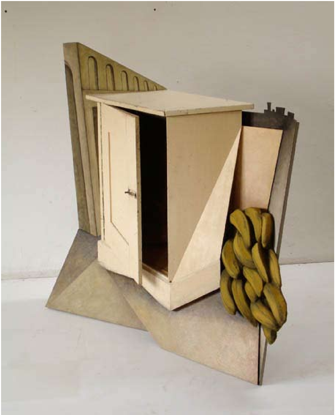
“la gare montparnasse”, 2008 (side) 135 x 53 x 135 cm wood, cloth, acrylic