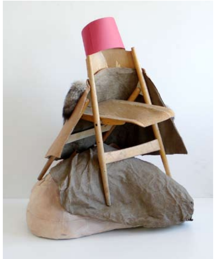
Carnival vs Lent 2006 wood, fur, leather, mixed media 100 x 75 x 120cm