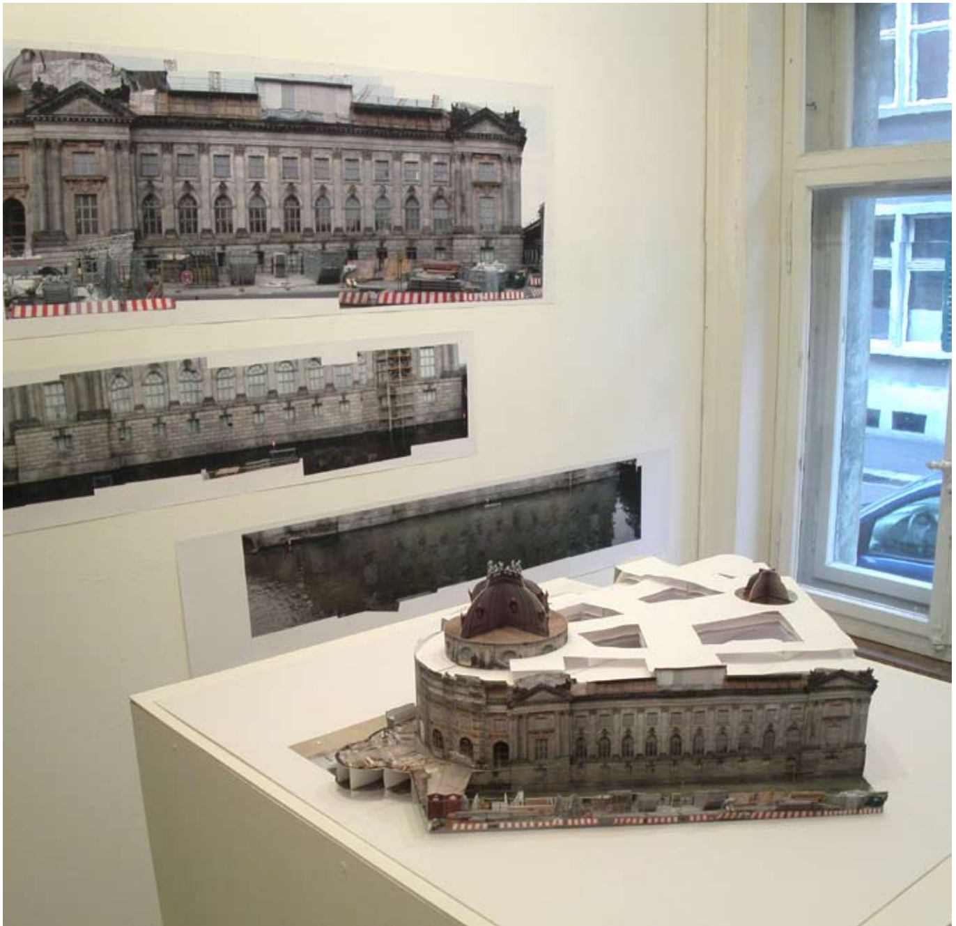
Bodemuseum 2004 pop- up, inkjet on paper, cardboard 105 x 75 x 28cm