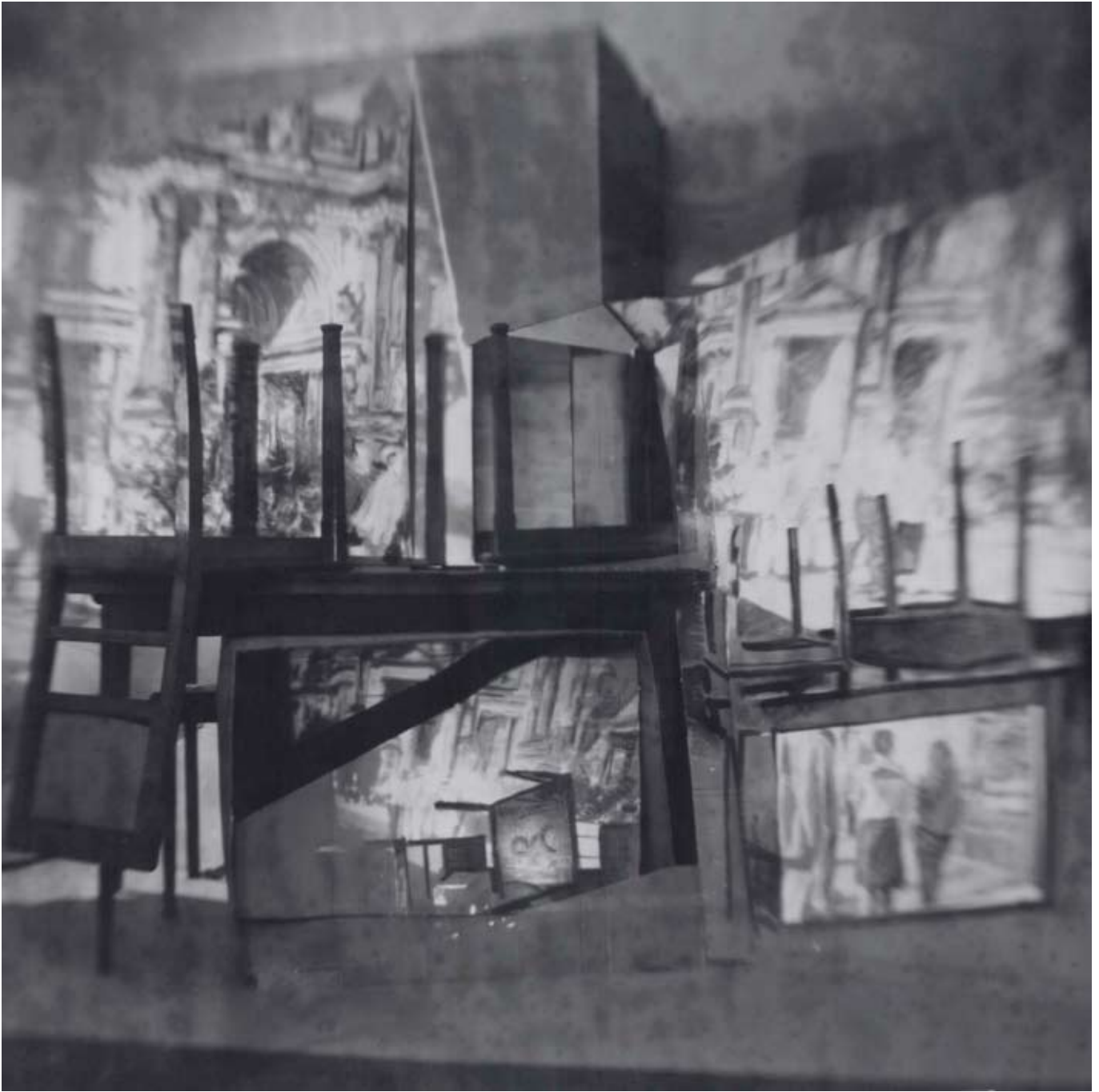
Dom 2 2001/2006 b/w photography with pinhole camera ca. 95 x 95cm Edition of 3/ 1+ AP