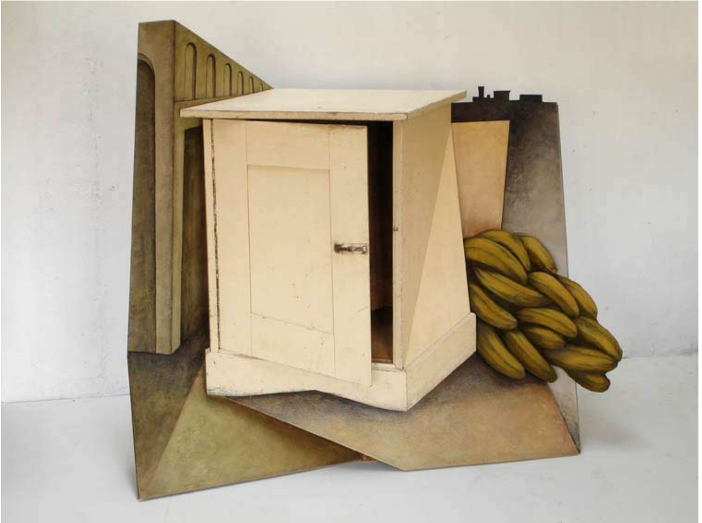
“la gare montparnasse”, 2008 (front) 135 x 53 x 135 cm wood, cloth, acrylic