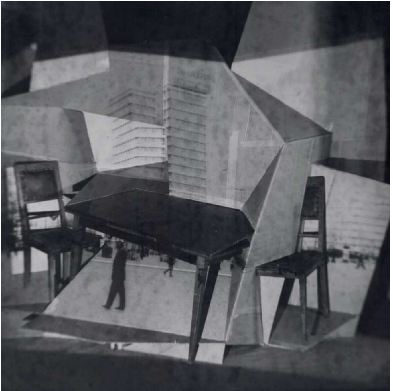
Alex 2001/2006 b/w photography with pinhole camera ca. 95 x 95cm Edition of 3/ 1+ AP