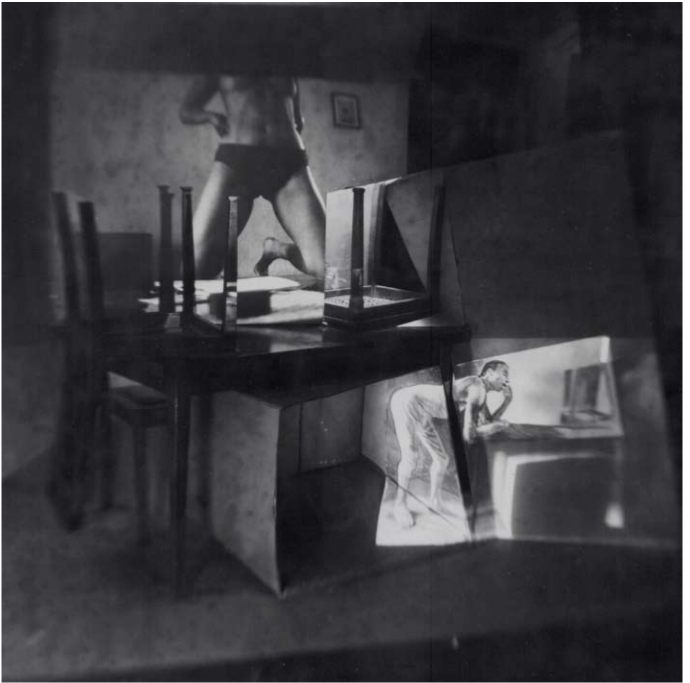
Hien 2001/2006 b/w photography with pinhole camera ca. 95 x 95cm Edition of 3/ 1+ AP