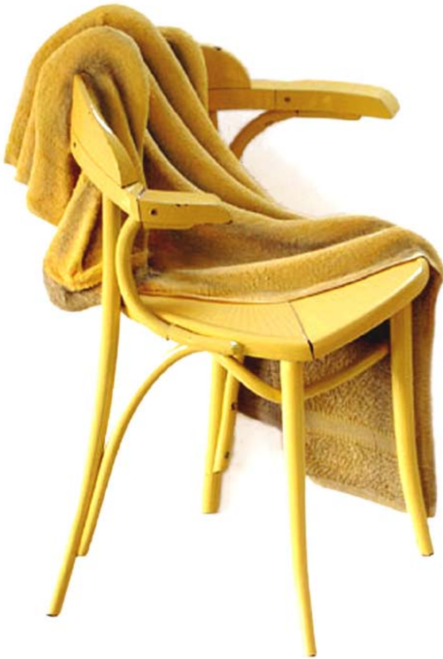
golden chair1, 2007 wood, towelling, gouache 110 x 80 x 30 cm