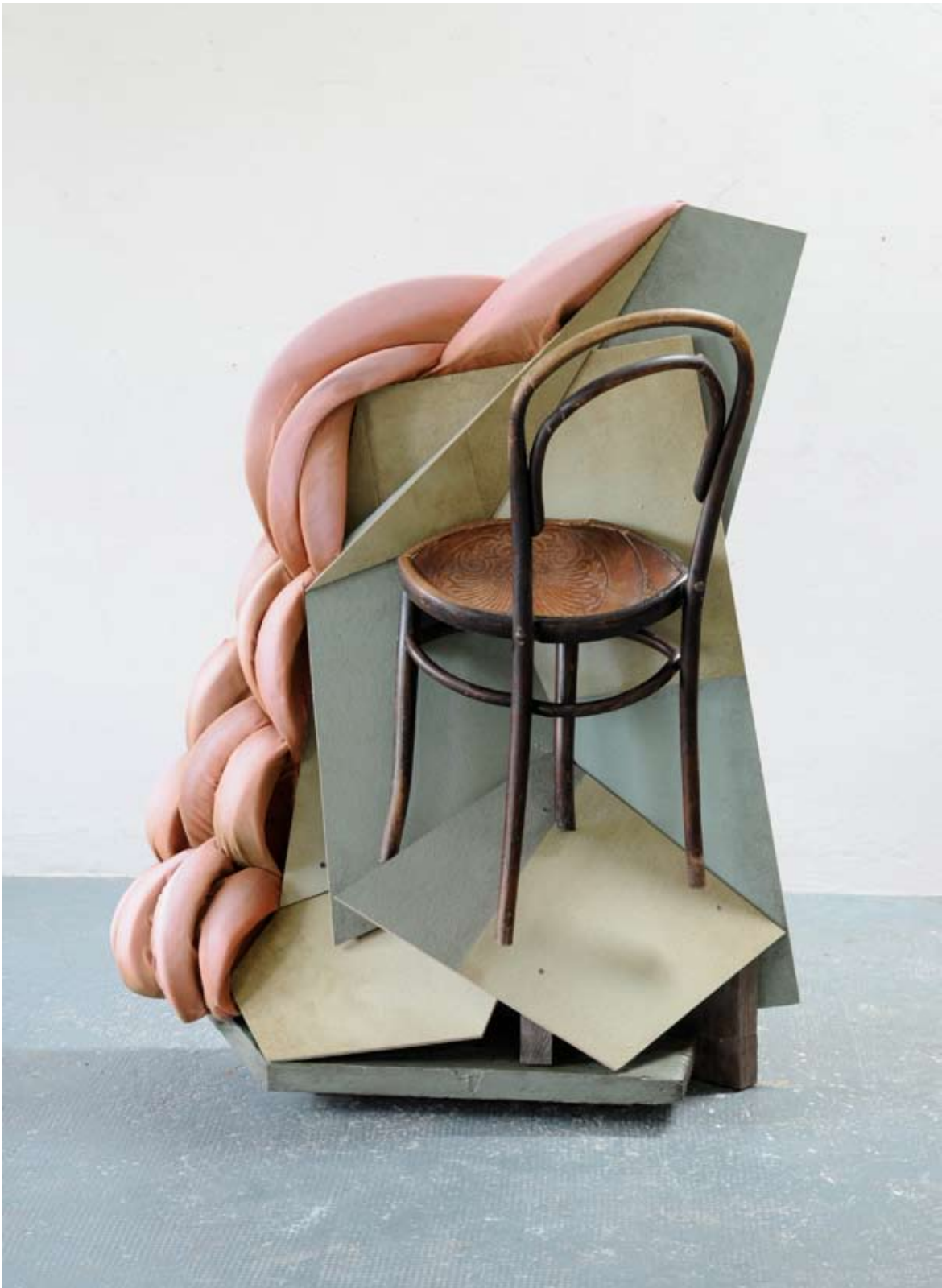
„cheval devant la mer“, (horse at the sea) 2008 aprox. 130 x 110 x 40cm chair, mdf, curtain cloth, glue paint