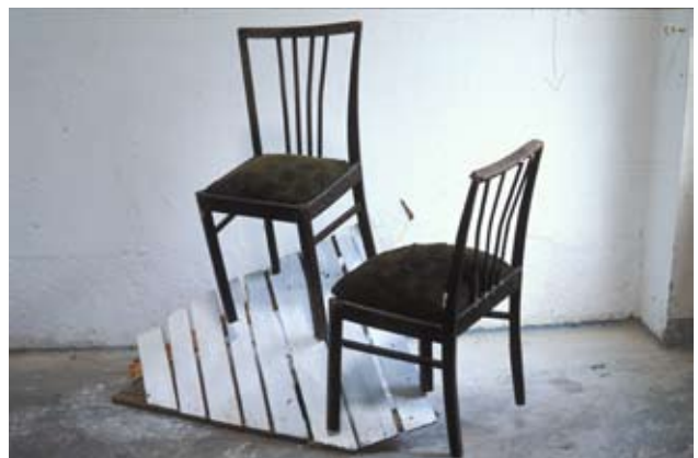
upholstery 2004 details